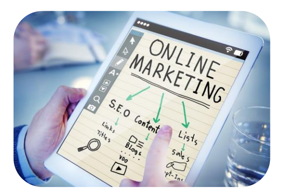
Effective digital and in-person marketing opportunities customizable to meet your marketing goals.