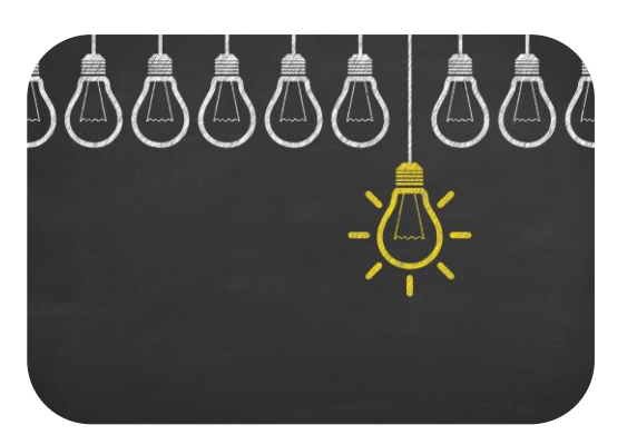
Showcase your expertise.