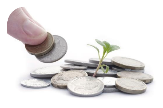
Affordable sponsorship options.